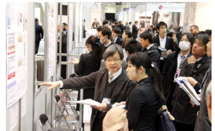
Academic Forum scene from 2017 show