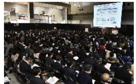
Conference scene from 2017 show

Also, the show has Innovative Cosmetics Ingredients Seminar venue and the Academic Forum which is located inside the exhibition hall will attract R&D professionals who are interested in the latest research of cosmetics ingredients.