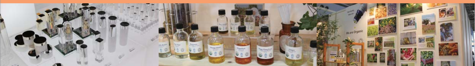
Exhibit at COSME INNOVATION, the BEST platform in the leading market, Japan and Asia!